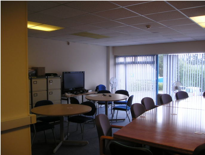
Ground floor office