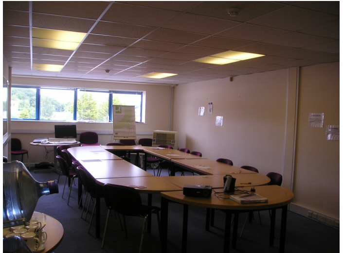
First floor office